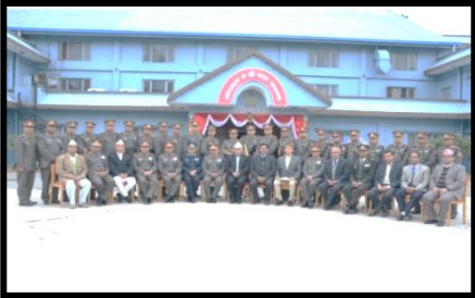
Graduation Ceremony of 3 rd APF Command and Staff Course