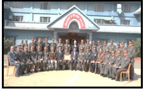
Graduation Ceremony of 2 nd APF Command and Staff Course