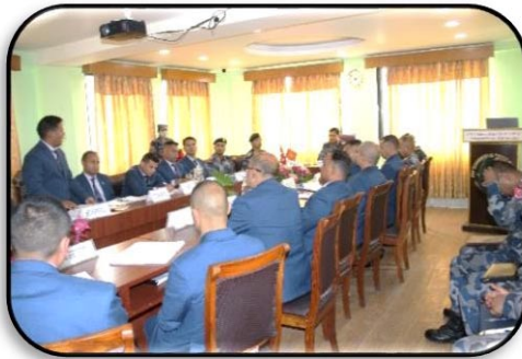
Interaction Program with AIG Narayan Dutt Paudyal