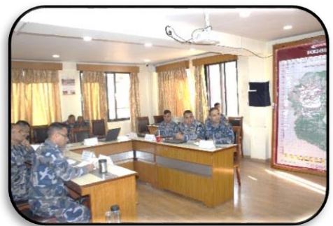
Disaster Management Exercise