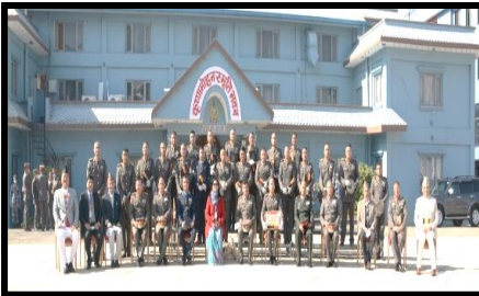
Graduation Ceremony of 5 th APF Command and Staff Course