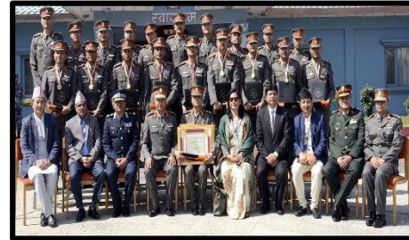
Graduation Ceremony of 6 th APF Command and Staff Course