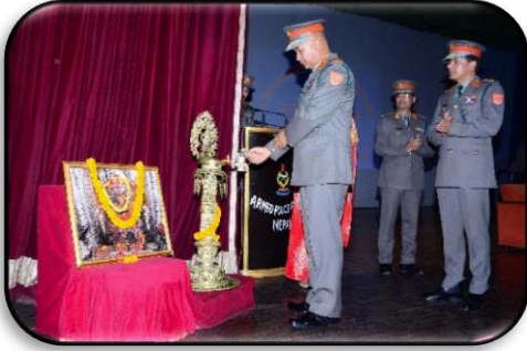
Opening Ceremony of 8 th APFCSC