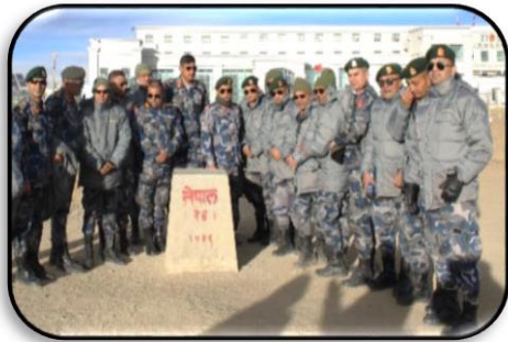
Visit at Lomanthang, Mustang During Internal Study Tour