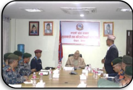
Interaction Program with Hon. Surendra Raj Pandey Chief Minister of Gandaki Province