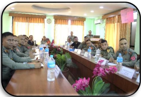
Conference on Disaster Management