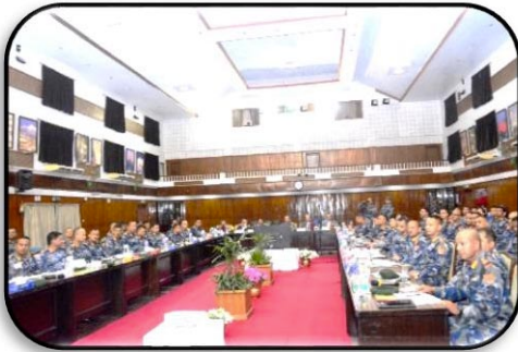
Conference on Border Security and Revenue Leakage Control