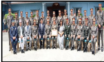
Graduation Ceremony of 7 th APF Command and Staff Course