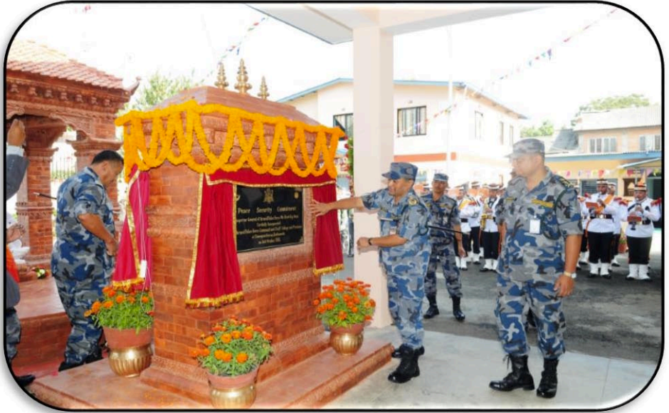
Inauguration of APF Command and Staff College by IG Koshraj Onta (Retd)