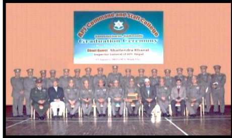
Graduation Ceremony of 4 th APF Command and Staff Course