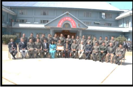
Graduation Ceremony of 1 st APF Command and Staff Course