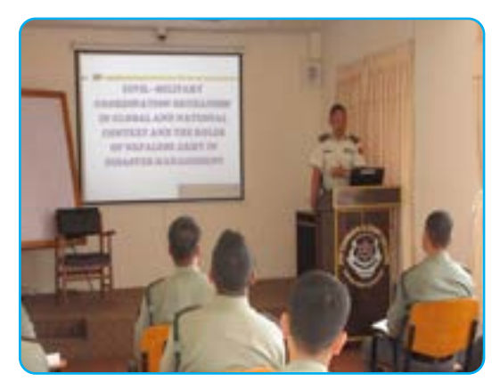
Col Baburam Shrestha during Class Discussion