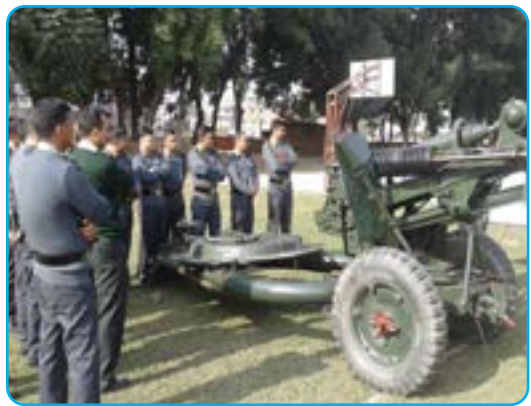
Student Officers during Field Visit