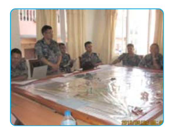
Student Officers during War Gaming