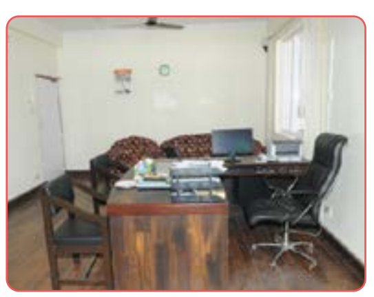
Academic Coordinator's Office