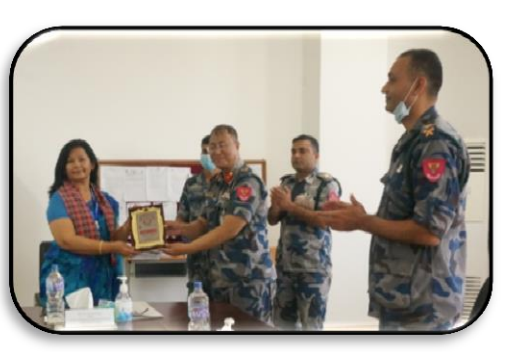
Presenting Token of Love to Dean