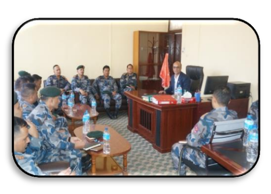
Survey Department Visit