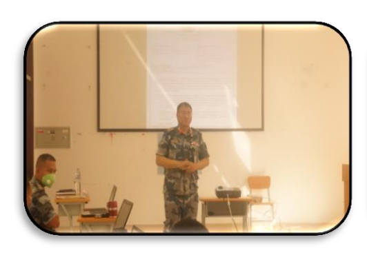
UN Exercise D-Briefing