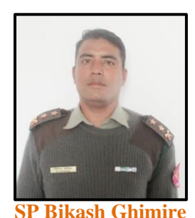
Chief Instructor psc (Nepal), MA, MBS